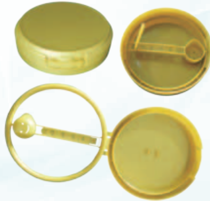
Integrated Moulding Lid and Spoon 一體成型的翻蓋和勺

在回顧年度內，塑料製品及加工業務未能完成年度預算，主要是由於珠海生產基地在遭受颱風「天鴿」的嚴重破壞，帶來一定的非經常性虧損，然而珠海生產基地借此契機，對所有生產車間按更高級別的潔淨要求更新，以進一步提高生產的衛生環境；重新購置新的高效率高配置的機器設備，提升整個生產的效率及產出。該基地在停產三個月後迅速復原，恢復生產，得到各主要客戶的肯定。此外，其用於奶粉產品之折疊式密封蓋與勺一體成型新技術的使用，縮短生產週期同時，更提供便捷的使用體驗給予消費者。