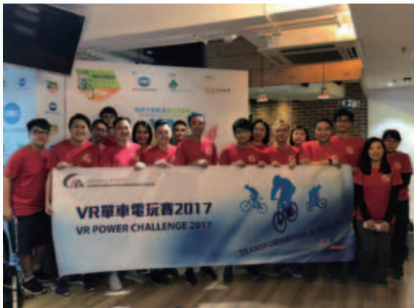
Participation in the “VR Power Challenge” 參加「VR單車電玩賽」

本集團不遺餘力地使環保概念成為業務營運和員工日常生活的一部分。為提倡「綠色工作間」，我們與同事們分享及推廣形式式的環保作業方式，加強他們的環保意識。例如，我們鼓勵員工養成習慣不打印文件而在電腦屏幕閱讀，以及選擇雙面打印、重用已單面打印的紙張和在辦公室設立廢紙回收點推廣廢物回收。於2017年，我們安排了連串環保活動倡導員工貫徹環保的生活方式，包括「VR單車電玩賽」、「無膠樽日」及支持「地球一小時」行動。這些活動讓員工以不同方式體驗綠色生活，比如踏單車發動可再生能源和減少使用膠樽。