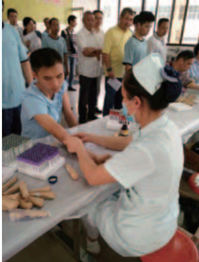
Conducting annual medical check-ups 年度身體檢查