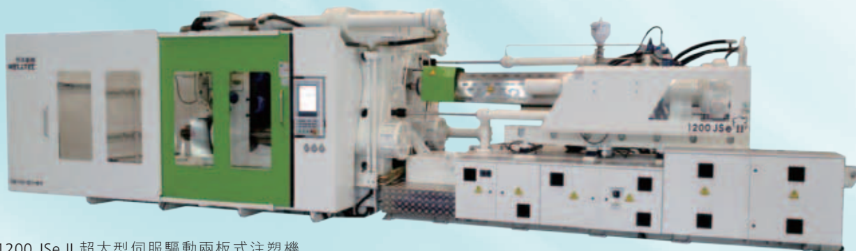
1200 JSe II 超大型伺服驅動兩板式注塑機 1200 JSe II Ultra Large-sized Servo-driven Two-platen Injection Moulding Machine

展望新的一年，在國家提出《中國製造2025》實施「製造強國」戰略下，內地工業經營環境預期將會持續改善。各省市的科技創新「十三·五」規劃對戰略性新興產業發展的支持和對傳統優勢產業轉型升級的推動，加上粵港澳大灣區的規劃將進一步利好粵港營商和投資環境，料會為市場帶來機遇。綜合各種宏觀情況，估計嶄新科技將陸續湧現，導致傳統營運模式、產品和服務不斷推陳出新，市場充滿各種商機和挑戰。對此，集團將繼續投資包括資訊科技的研發和創新工