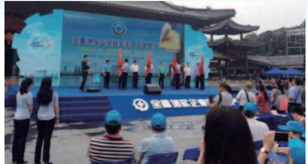
2017 Dongguan Safety Production Engagement Day 2017年東莞市安全生產諮詢日