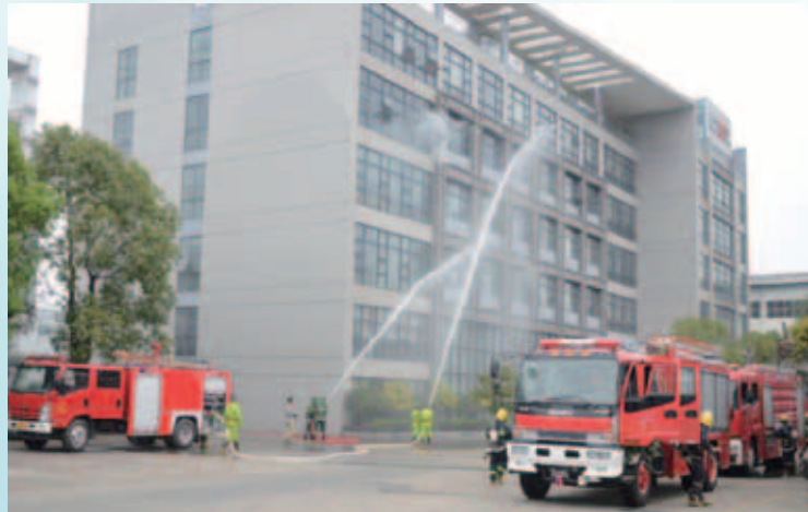
Fire drill by Dong Hua in 2017 2017年東華火警演習

In August 2017, continuing an established practice, the Group organised a complimentary annual health screening for different levels of staff in Dongguan. Dong Hua was also invited to join the “2017 Dongguan Safety Production Engagement Day”, supporting the implementation of safety-oriented production responsibility in enterprises. We strive to serve as a leading light for the industry by consistently enhancing our training programmes and keeping abreast of the latest laws and regulations concerning production safety.