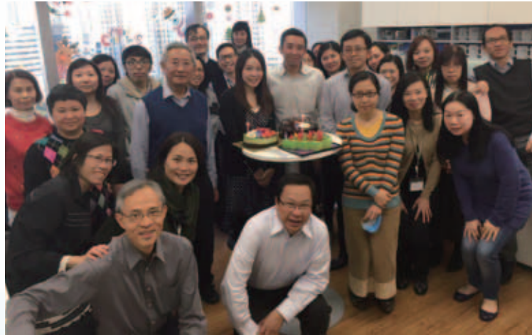
Staff at a monthly birthday celebration 每月生日會員工合照

在工作以外，我們會舉辦內部康體活動，例如足球、籃球和羽毛球等，而本集團亦組織或參與多種與外展活動，例如大同健行2017、2016/17年度新界區百萬行及第五屆東城運動會。2016年度先進表彰晚宴是員工翹首以待的活動，晚會除了公開表揚日常工作表現卓越的員工，並向年資10年及20年的員工頒發長期服務獎，感謝他們多年來所作出的貢獻。