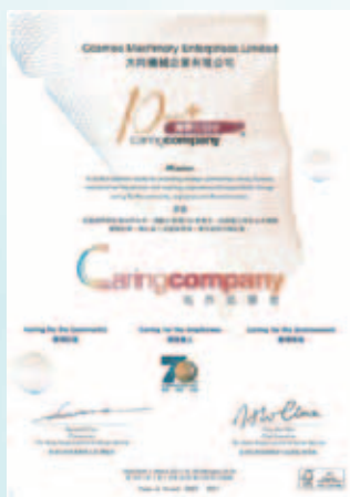
Awarded the Caring Company Logo for the tenth consecutive year 連續第十年獲頒發「商界展關懷」標誌