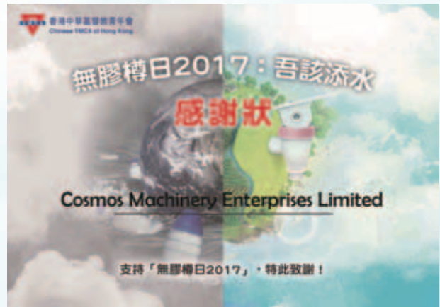
“No Plastic Bottle Day” 「無膠樽日」