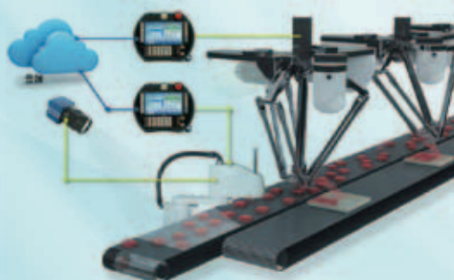
Intelligent Hi-speed Manufacturing Control System (Cloud Technology Interface equipped) 智能高速生產控制系統（具備雲端接口）

由於本年度整體營商環境較去年有大幅改善，國內工業製造錄得明顯增長。集團的貿易業務一向聚焦於如汽車、家電、半導體、通訊設備、注塑機及彈簧機等有關行業，業務因而取得不俗的增長，整體業務的營業額較去年增長約10%。可惜由於歐美及日本製造業亦同步復甦，引致出口中國的精密零部件供應短缺，影響交貨的進度。捆綁式銷售策略成功增加了國內產品銷售的同時，貿易板塊亦成功開拓了新能源汽車的零部件市場，為未來的市場打通突破口。此外，貿易業務大幅減低了慢流貨庫存並嚴控應收賬在合理水平，旨在保持穩健的財務實力。