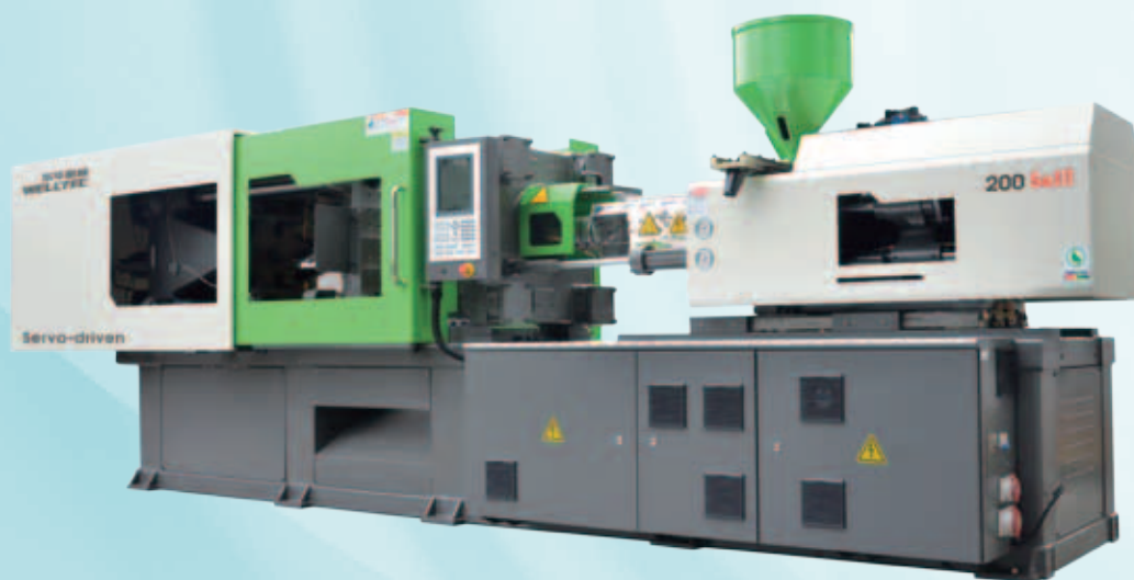
200Se III General Purpose High-end Servo-driven Injection Moulding Machine 200Se III 通用型高端伺服注塑機

2017年，注塑機業務加大了產品的開發和優化工作，特別是二板機系列通過性能的優化，效率、速度和可靠性明顯提升，迎合了汽配及家電兩大行業的市場需求，成為本年度的銷售增長點。另外，一些行業專用機的銷售本期也有明顯增長，但仍需在品質、成本等方面進一步優化，這也將是下一年度的重點培育專案。「工業4.0智能方案」的成功推行，也為產品向智能化發展提供了平台。今後還將繼續加大產品的研發，以滿足不同行業的市場需求，推動我們的產品向系列化、專業化、智能化發展。